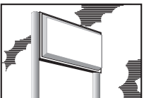
DOUBLE FACE BETWEEN POLE