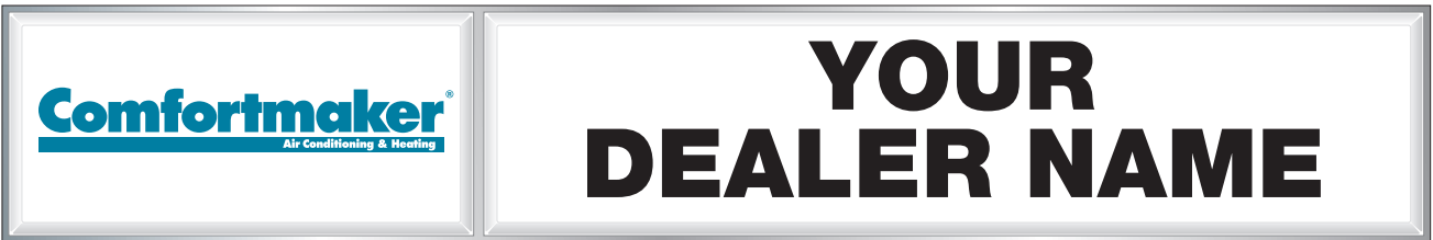
3'x18' 0 1/2" logo / dealer sign ... 3'x6' logo / 3'x12' dealer

Dealer name faces are thermoformed of UV Protected Polycarbonate with names applied in black vinyl letters. Illumination is furnished by high output fluorescent lamps on one foot centers and powered by energy efficient electronic ballasts. All signs are UL listed and labeled.