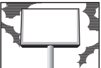
DOUBLE FACE CENTER POLE