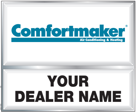
5'x6' 0 1/2" logo / dealer sign 3'x6' logo / 2'x6' dealer