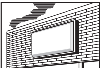
SINGLE FACE WALL MOUNT