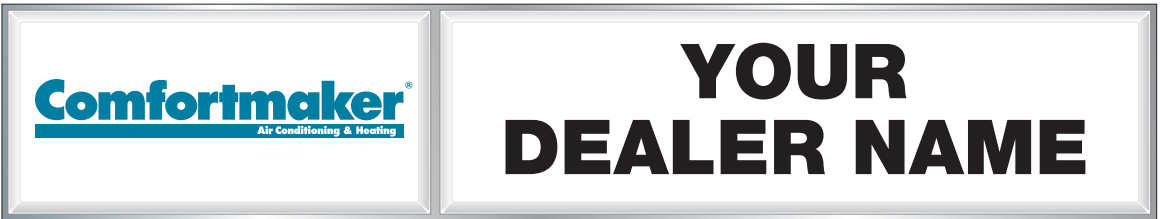
3'x16' 0 1/2" logo / dealer sign ... 3'x6' logo / 3'x10' dealer