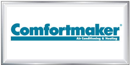
3'x6' 0 1/2" logo sign

The Comfortmaker business identification program tells today's consumer you are an authorized dealer of one of the most well known brands in the industry. You can display only the brand sign or you can personalize it with your business name in a wide variety of sizes. Built to demanding commercial specifications, these signs are designed to provide years of trouble free service. All signs feature virtually unbreakable polycarbonate faces, rust resistant aluminum housings and energy efficient electronic ballasts. All signs bear the U.L. label and are produced here in the United States.