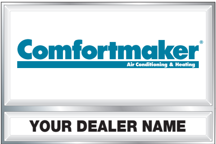
4'x6' 0 1/2" logo / dealer sign 3'x6' logo / 1'x6' dealer